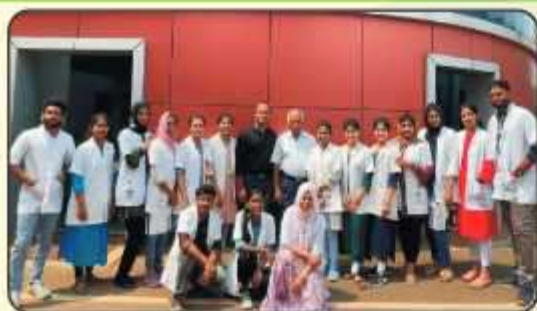
M.Pharm Students Sangrose Laboratories Pvt Ltd, Mavelikara