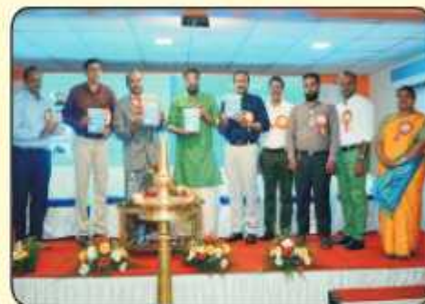
Textbooks Launch by Eminent Guests

The Department of Pharmaceutics proudly organized a One Day National Seminar on " Latest Innovations in Pharmaceutical Sciences - (LIPS 2023) ", on 7 th January 2023.