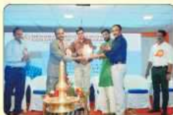
Honour to Chief Guest