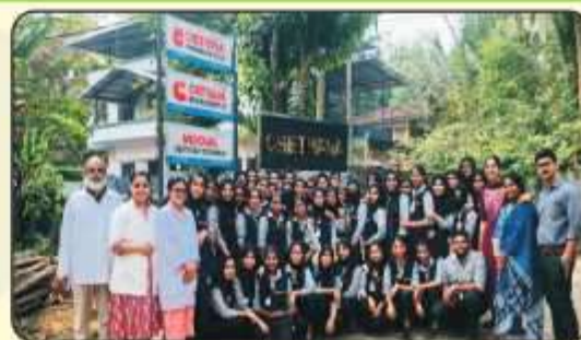
D. Pharm Students Chethana Pharmaceuticals, Perinthalmanna