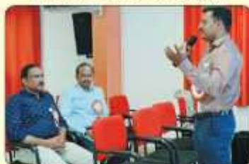
Extraordinary Talks by Eminent Speakers during Session