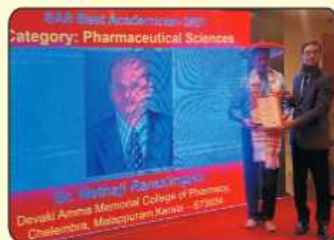
Best Academician Awards