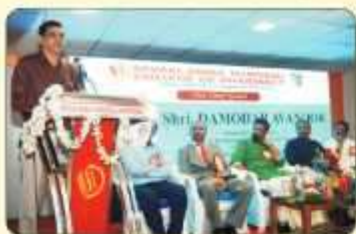
Chief Guest Speech