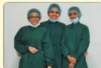
Industrial Trip - Sangrore Laboratories Pvt Ltd, Kerala