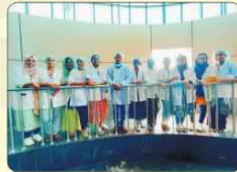
Industrial Visit Sangrore Laboratories Pvt Ltd