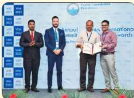
During Award Ceremony